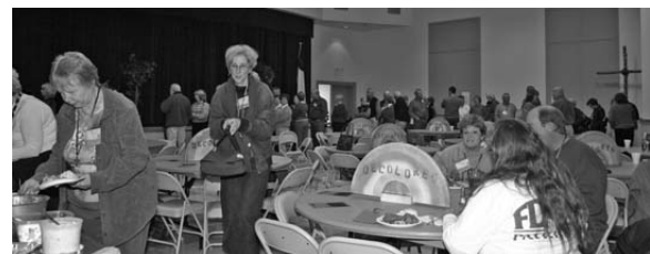
Gathering for Meal after Fall Walks

See You at the Gathering-Feel the Warmth